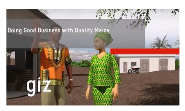
SSAB (2017) training video of GAP for maize

One reason for the success of our training is the projects' gender sensitive training material. A good example is the SSAB project's training videos released in 2017: SSAB developed one video on GAP for maize and another one on good nutrition practices. The characters in the video, Obi and Aminat, are a couple who do cocoa farming. The videos draws a picture of two human beings having equal rights and responsibilities in their relationship and in regards to their farming activities. Thus Obi tells us, that in "February we clear the plot from all herbs" while weeding with a machete while Aminat is raking the herbs. And while Aminat tells us that "the roots of maize needs a well prepared seed bed", she and her husband "work the soil well" side by side. The same is true for the video on nutrition. Both husband and wife tell us the story of their mutual good nutrition practices. If you want to know more, please find the videos on the <u>SSAB website</u>.