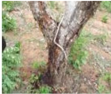
Effect on tree trunk