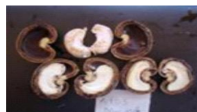
Good kernel wholes recover