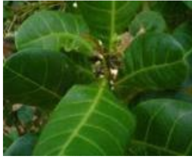
Effect on growing tips