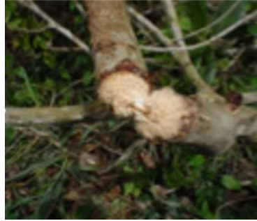
Effect on branches