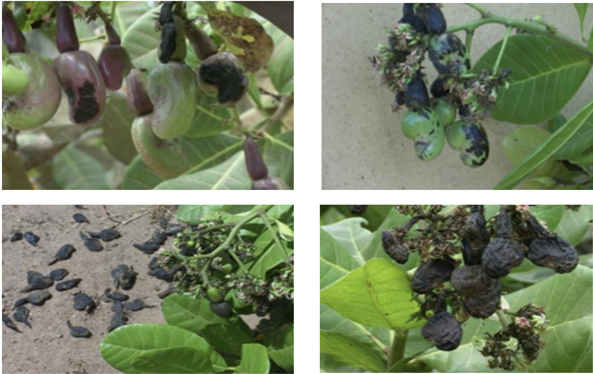
Figure 35-38: Cashew leaf and nut blight disease

It is important to explain that insect pests like Helopeltis bugs, Coconut or Aeroplane bugs, Thrips and Mealybugs are abundant in all cashew growing areas in Africa and should be controlled if their attacks reach economic threshold levels. Biological control of the sucking pest using weaver ants ( Oecophylla longinoda ) has been shown to reduce pest infestation in other countries. Plate 11 shows insect-pest and their attack on shoots, leaves, stem, nuts and kernels.