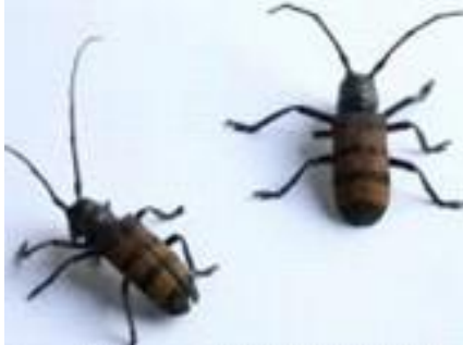
Cashew stem girdlers