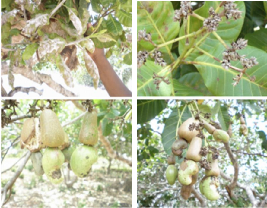
Figure 33: Powdery mildew disease