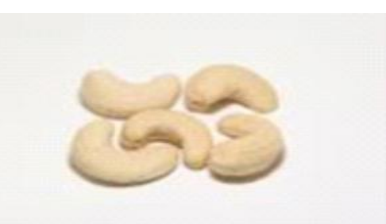
Easy peeling of the testa