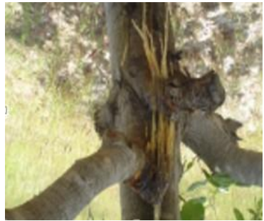
Figure 39-47: Cashew insect-pests and their damages