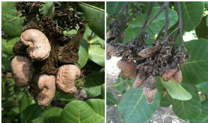
Figure 34: Anthracnose disease