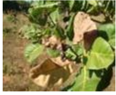
Effects on inflorescence