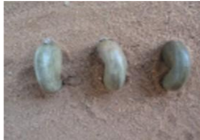
Bad nut shapes