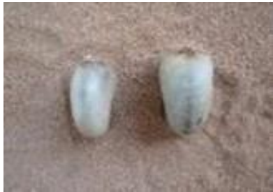
Good nut shape