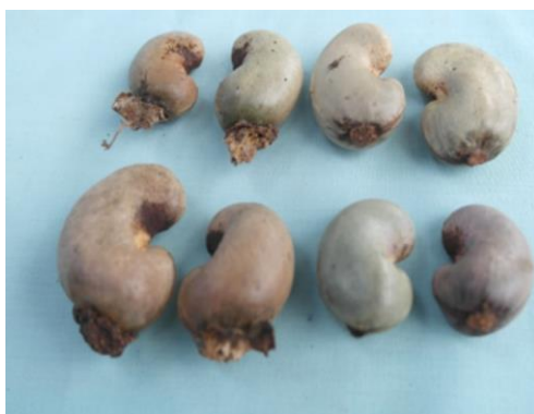
Figure 23: Nuts with and without apple flesh

This characteristic is important for long term storage of cashewnuts. Cashew varieties that exhibit difficult separation of the nut from the apple have a shorter shelf life. The flesh which remains on the nut could absorb moisture while in storage and cause the nuts to initiate the germination process. Plate 5 shows the two types of nuts with and without dry apples flesh.