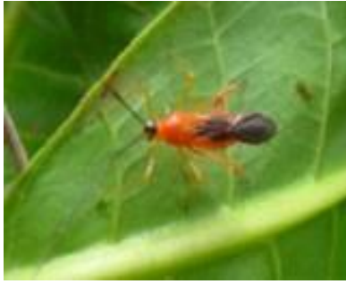
Adult Helopeltis bug