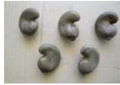
Bad nut shapes